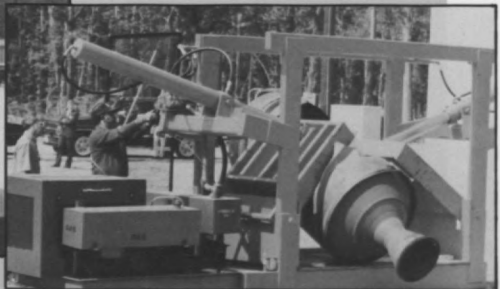
Two photos courtesy of the U.S. Government