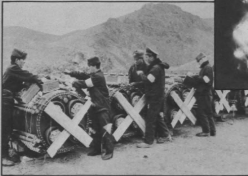
"By explosive demolition . . ."