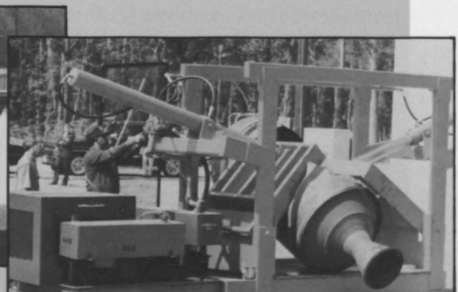
Two photos courtesy of the U.S. Government