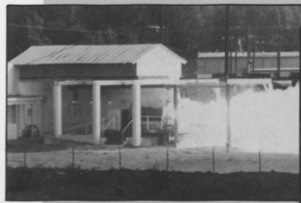
Elements "not destroyed in this process shall be burned, crushed, flattened . . ."