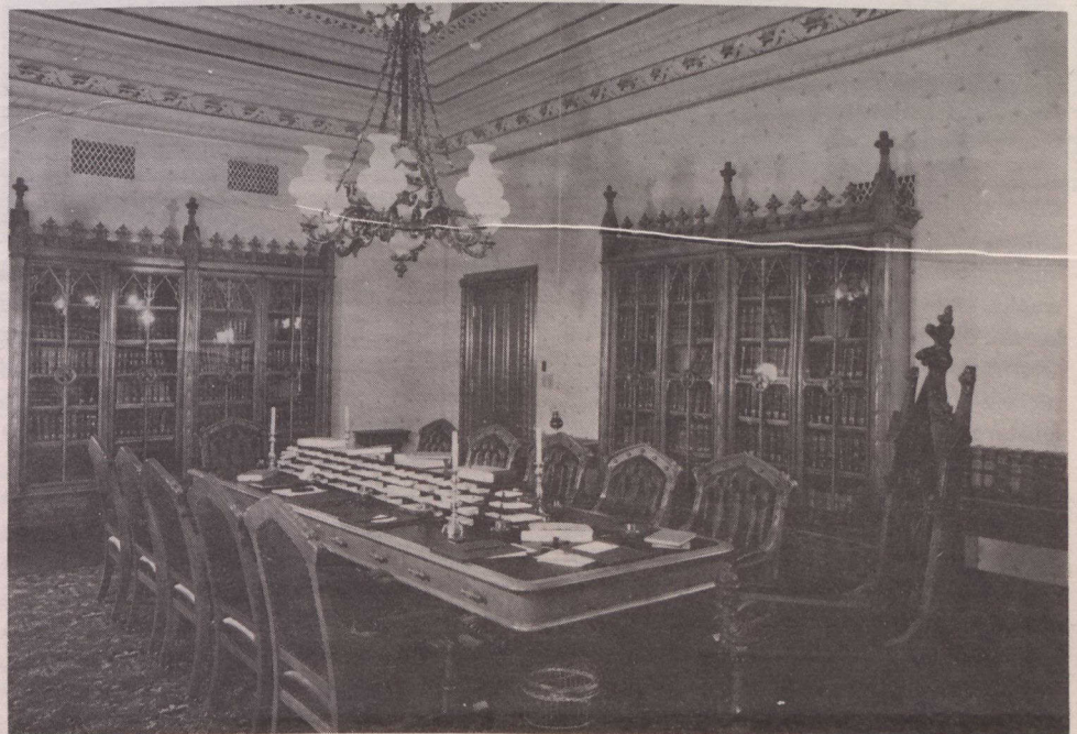
A view of the refurbished Privy Council Chambers.

During the winter the building can be seen by guided tours on the weekends but it is expected that it will be open seven days a week in the summer.