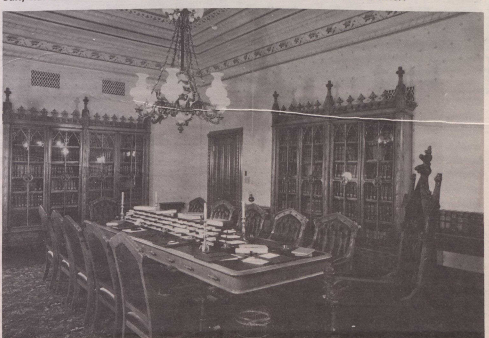
A view of the refurbished Privy Council Chambers.

During the winter the building can be seen by guided tours on the weekends but it is expected that it will be open seven days a week in the summer.