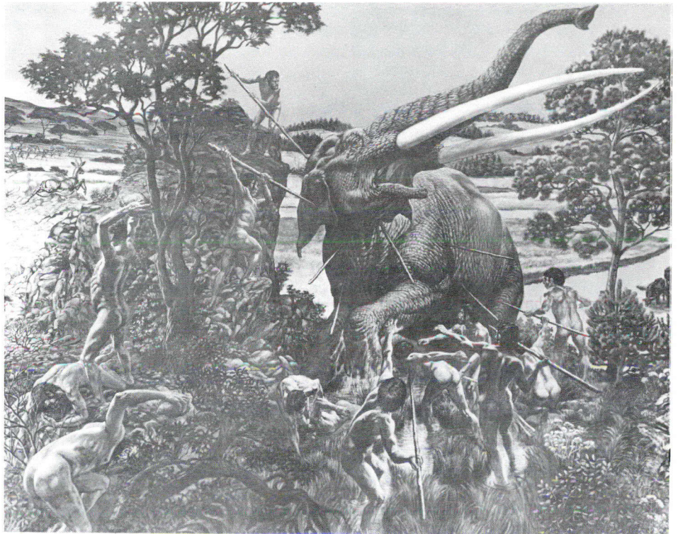
Scene from mural in Dome II of "The Immense Journey" Hall shows the

"The Immense Journey" is one of five halls in the new National Museum of Man. The second, "Canada before