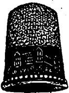
Premium No. 63.—Silver Thimble.

Solid Sterling Silver Thimble. A great bargain. All sizes. State size required, or where size not known, either small, medium, or large.