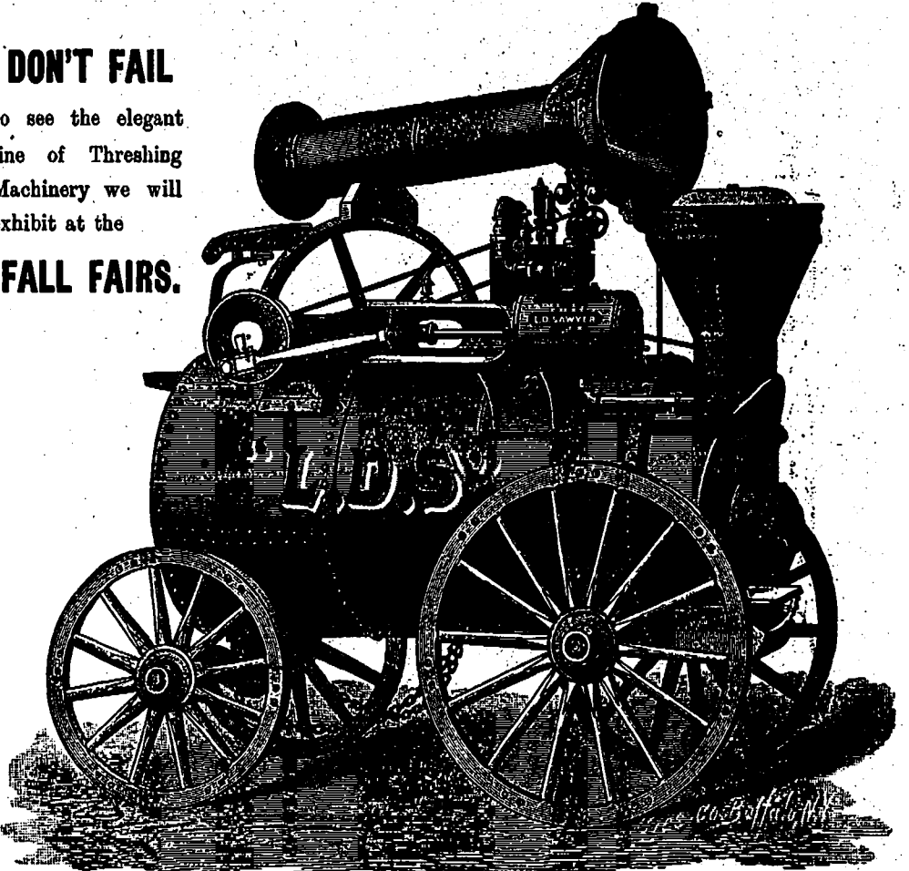
The "L. D. S." Portable and Traction Engines.

Coal Burning, Wood Burning, Straw Burning, and Traction