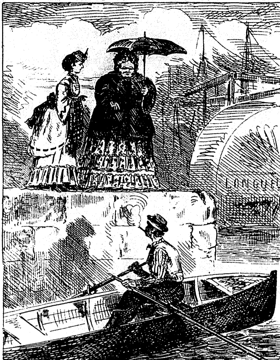
JONES, who engaged to row his cousin down to Longueuil to see the boat race, was (of course) delighted to find that his aunt insisted on going too.