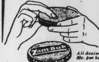
All dealers 50c. per box

Zam-Buk is a pure antiseptic herbal balm possessing a very definite and important medicinal action on the skin. In its character and in its results it is altogether different to the usual ointments and salves. Zam-Buk safeguards you against blood-poison and skin-disease.