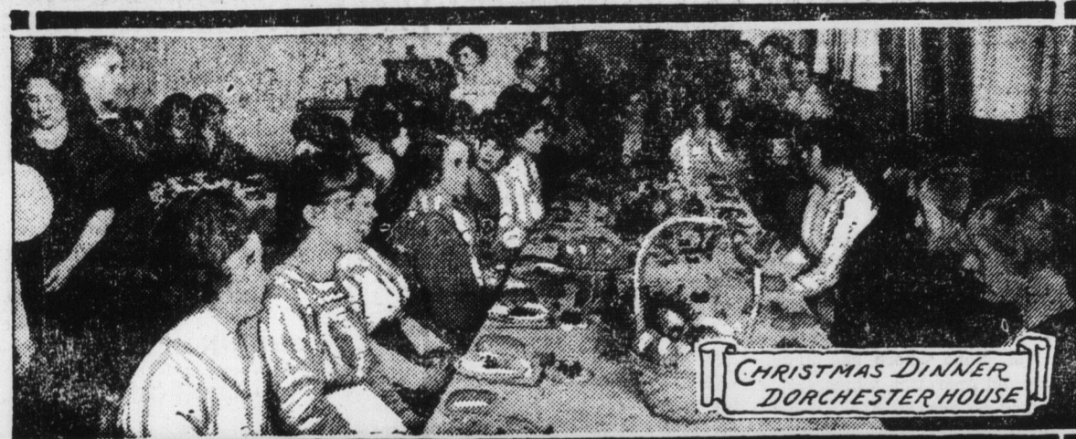
CHRISTMAS DINNER DORCHESTER HOUSE

In the midst of the city of Montreal, half-way between the uptown and downtown business districts, on the corner of two of the best residential streets, there stands, surrounded by large shade-trees, a substantial and comfortable old-fashioned stone dwelling-house, such one of the pillars of the wide hospitable looking entrance is a brass plate announcing the house to be Dorchester House, the Canadian Women's Hostel of Montreal.