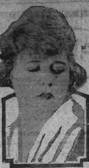
ETHEL CLAYTON in "Maggie Pepper" A Paramount Picture