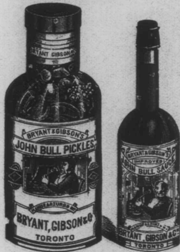
This is a facsimile of our bottles.

BRYANT, GIBSON & Co., TORONTO, Manufacturers of