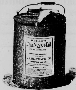
3 and 5 Gal. Imperial Measure