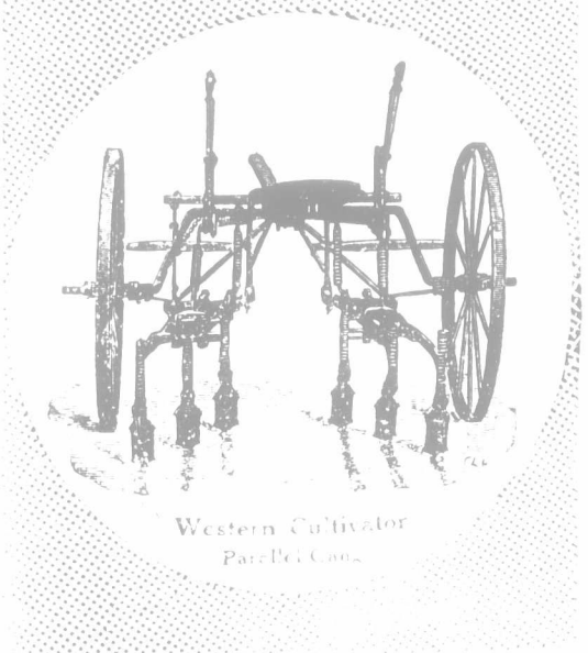
Western Cultivator (Parallel Gang)

The centre illustration shows our Western Spring Tooth Cultivator, which is especially useful in the corn field. Can be readily adjusted for field work by connecting a centre attachment which we supply with each cultivator at small cost. Really four machines in one—a corn cultivator, bean cultivator, field cultivator and bean harvester. Pressure can be applied to each gang to make it stir and turn the soil no matter how hard or dry. Reversible blades with wide and narrow points go with each machine. We can also supply wide weeder blades if desired. Here is an implement that will stand up to its work anywhere in Canada. Give it a chance to prove its value on your own farm.