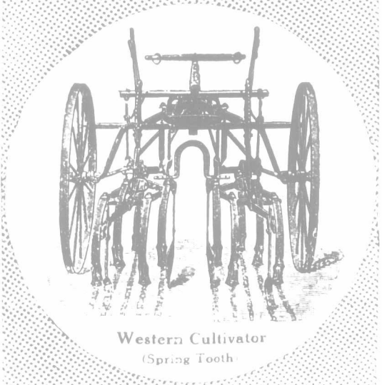
Western Cultivator (Spring Tooth)

For an all-round general service cultivator you will find our Diamond Point an excellent tool. No need to inquire about the quality of the materials and workmanship—these essentials are always well taken care of in the Cockshutt factory. The Diamond Point can be had with one or two levers as desired. You will notice that we have made the frame fairly lengthy so that trash will not clog at the rear. The two wheels make them steady running and the long handles give the operator easier control. All the adjustments are made as simple and perfect as possible—there are no complicated parts to get out of order. We can furnish all sizes of teeth for this cultivator.