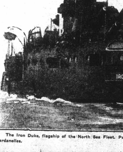
The Iron Duke, flagship of the North-Sea Fleet. Powerful ships like this are assisting in forcing the Dardanelles.

GETS LOCOMOTIVE ORDER. New York, May 17.—Lima Locomotive Corporation has been awarded an order for 25 modern heavy consolidation freight locomotives by the Pennsylvania Railroad for its lines west.