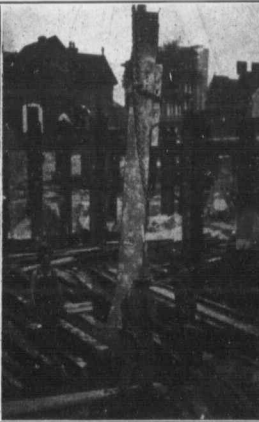
PLACING A COLUMN.