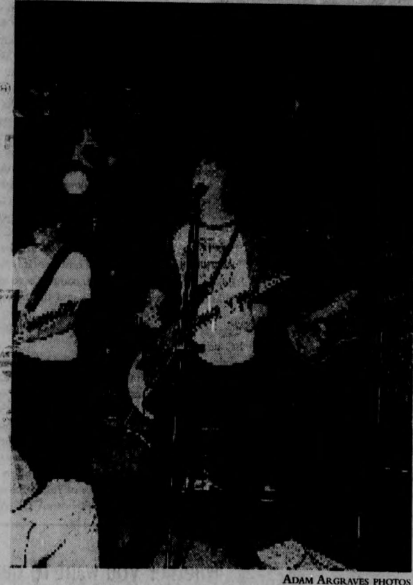
The Superfriendz wowed their crowd with their frenzy of guitars ..

for I think that they took this difficult