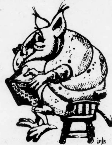
ARMIE The RIVERVIEW ARMS ARMADILLO

Remember...your Good Times are at the Bottom of the Hill.