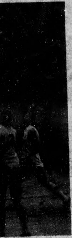
return of the ball during playing host to the winner winner advances to the

and cheer for the Red Saturday at 1 p.m. in the They want your