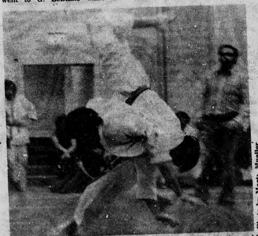
During judo action on the weekend one member of a judo club throws his opponent for a full point (an ippon) during his match. The throw is worth

Some very good Judo is expected to be seen this weekend and a good supporting crowd will help the Club capture the trophy.