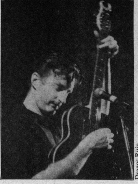
Billy Bragg on stage in Calgary.

Interspersed between Bragg's short, simple and lyrically sagacious songs was