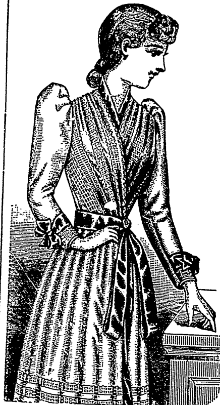
Figure No. 377 P.—Misses' Dress.—This illustrates Pattern No. 3766 (copyright), price 30 cents.