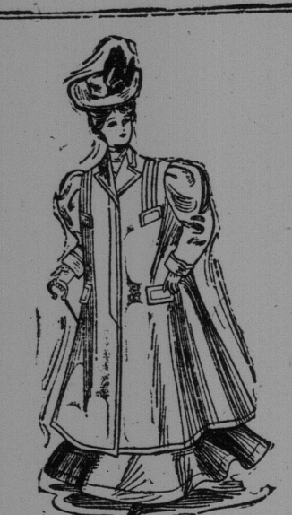
This Berlin made garment, very fine tweed; attractive patterns at $8.70 and $10.50. This very stylish tweed cos; with velvet collar, priced $12.00.