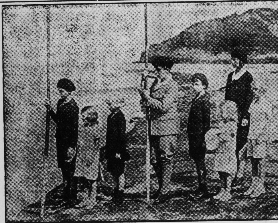
The young "Emperor" Otto of Austria, whose father was deposed, is pictured here with his brothers and sisters on the Spanish coast, near Leguizamo, where they are living now with their mother, the Empress Zita.