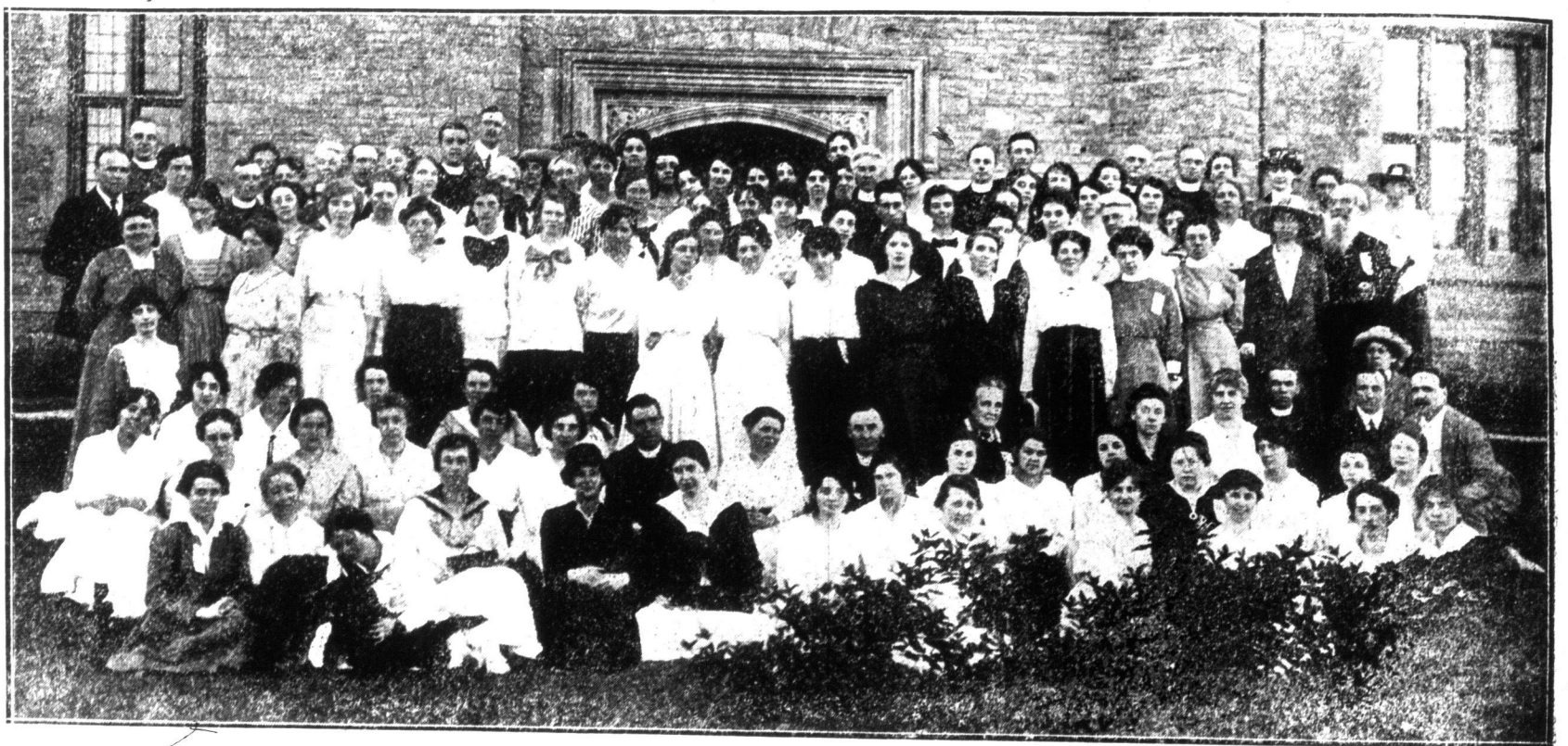
Church of England Summer School at Bishop Strachan.