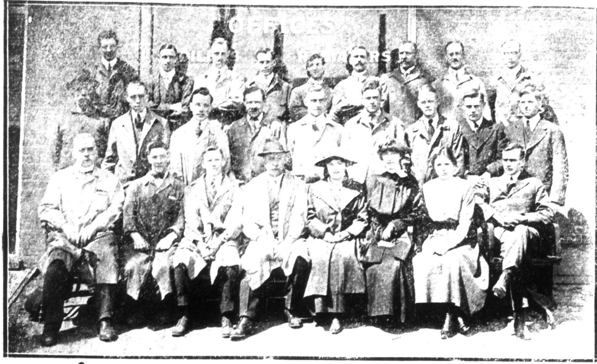
Office staff, foremen and inspectors at one of Toronto's munition plants.