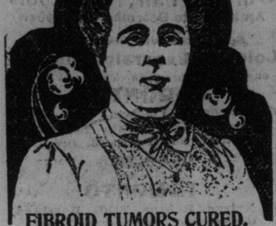
FIBROID TUMORS CURED.