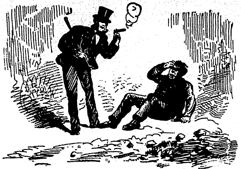
GENT.—"Did the fall hurt you, Pat?" PAT.—"Arrah! your honor, 'tis not the fall, but the stopping so sudden."