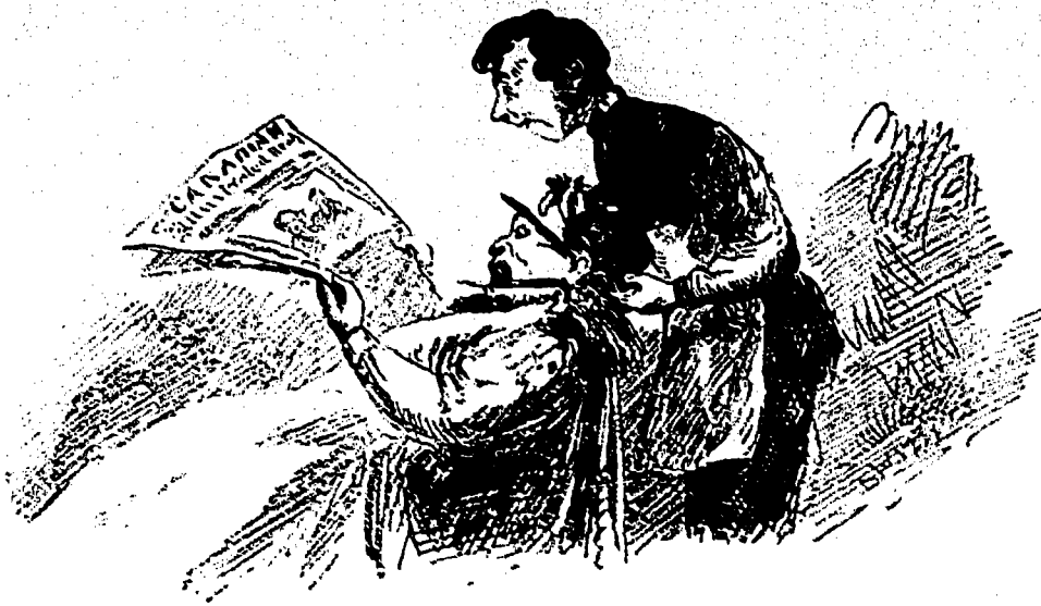
Too Fond of Pictures.