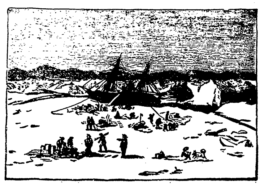
ABANDONING A SELP IN ABOTIC REGIONS.

WHAT A BOY DID. The Duke of Argyle, walking in his garden one day, saw a Latin copy of a