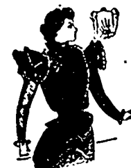
1380—Ladies' Basque with Russian Blouse Front. Size 32, 34, 36, 38, 40.

Hence it's the most popular paper pattern of the times.