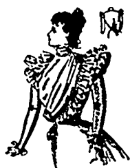
1337—LADIES' WAIST. Size 32, 34, 36, 38, 40.

21 GOLD MEDALS for QUALITY and EXCELLENCE.