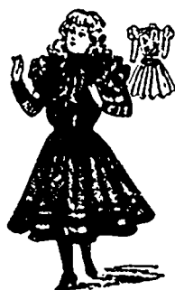
1375—GIRLS' DRESS. Size 6, 8, 10, 12 years.