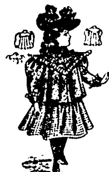
1271—Girls' Jacket. Size 1, 2, 4