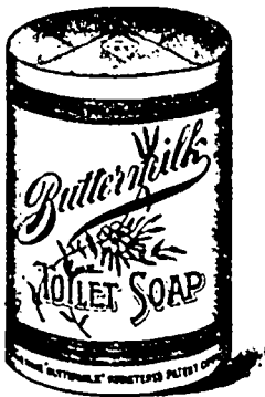
1/4 size fac-simile of package.