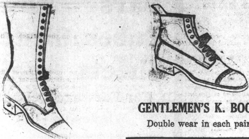
GENTLEMEN'S K. BOOT. Double wear in each pair.

LADIES' HIGH CUT K. BOOT Leather lined. An ideal Fall and Winter Boot