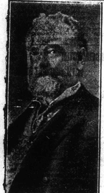
HON. WILLIAM PUGSLEY.

All the Attractions Wil be in Full Running Order Today