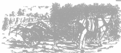
DEERING IDEAL CORN BINDER.

CANADIAN BRANCHES: Toronto, London, Montreal, Winnipeg.