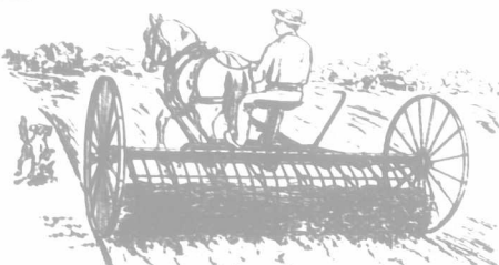
DEERING IDEAL HAY RAKE.

Corn Shockers, Huskers and Shredders, Oil, Knife and Tool Grinders.