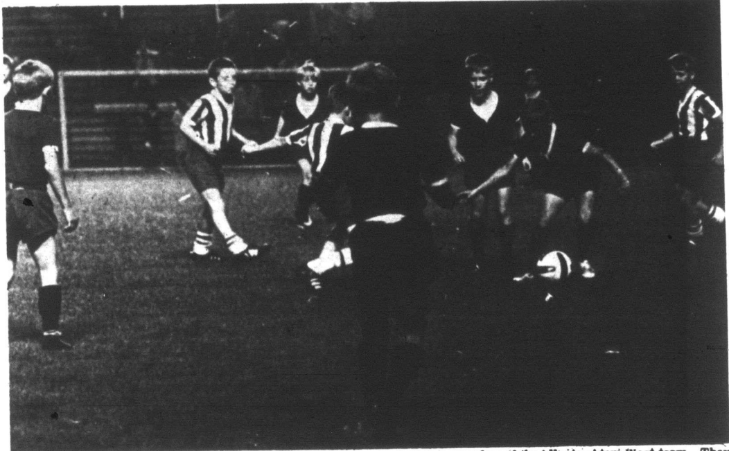
Part of the action at last week's Mississauga-Falcon Soccer Night at Varsity Stadium. Youngster about to kick the ball is a member of the All-star Atom West team. They lost to Atom East 1-0.

Get out to see these teams play. It's not bush league stuff, it's top notch fastball. The fresh air is great. So is the action.