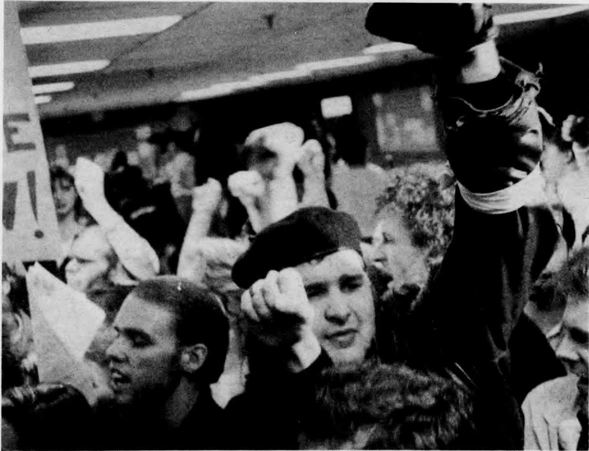
ANGRY PROTESTERS: 300 students showed up to protest Tory policies and the secrecy behind Mulroney's visit. Flying insults, accusations and macaroni greeted the PM.

Some students called on Mulroney to slash the proposed GST