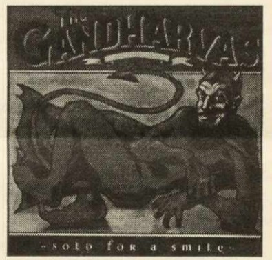
Sold for a Smile The Gandharvas Watch Music