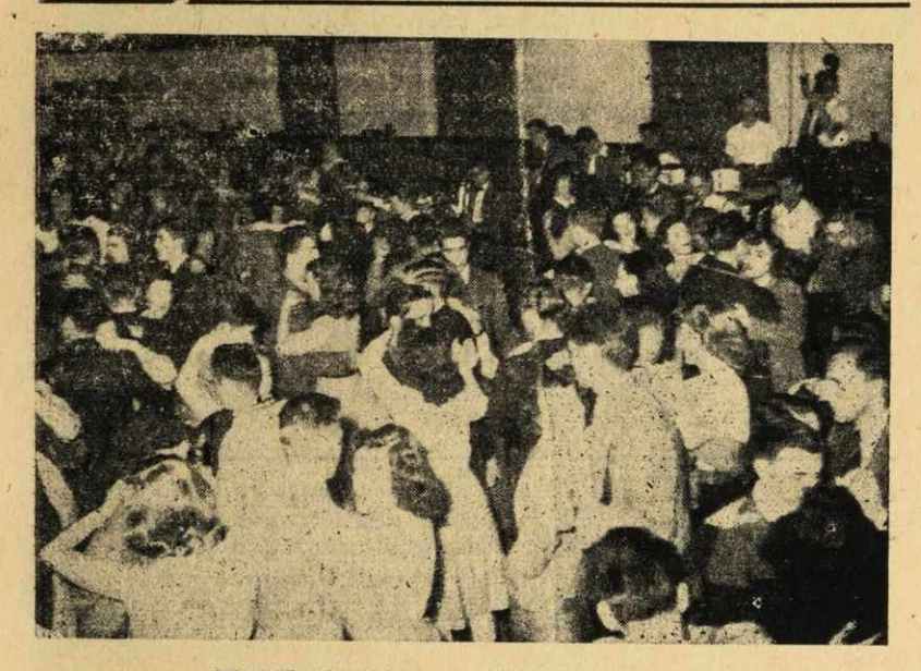
THE OPEN WINDOW At the Acadia dance Dal supporters celebrate the great victory.

In the spirit of such events, the Dal safari was well equipped with fruit juice of various sorts, and found a rousing welcome in the shape of familiar signs and notices when they reached the wilderness in question