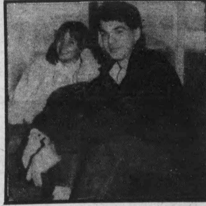
An A! any A!