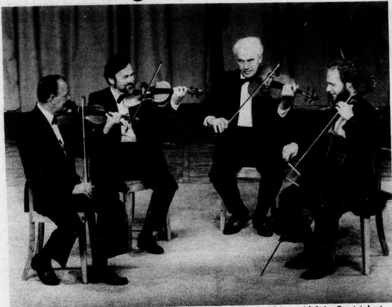
"Ok boys! - 'Pretty vacant' in F11" (Hasn't this joke been used before? - Ed) Brunswick String Quartet shoot glances.

One of Canada's foremost chamber music ensembles, Fredericton's own Brunswick String Quartet, will be performing the first of their Creative Arts Committee concerts on Sunday, Nov. 29 at Memorial Hall.