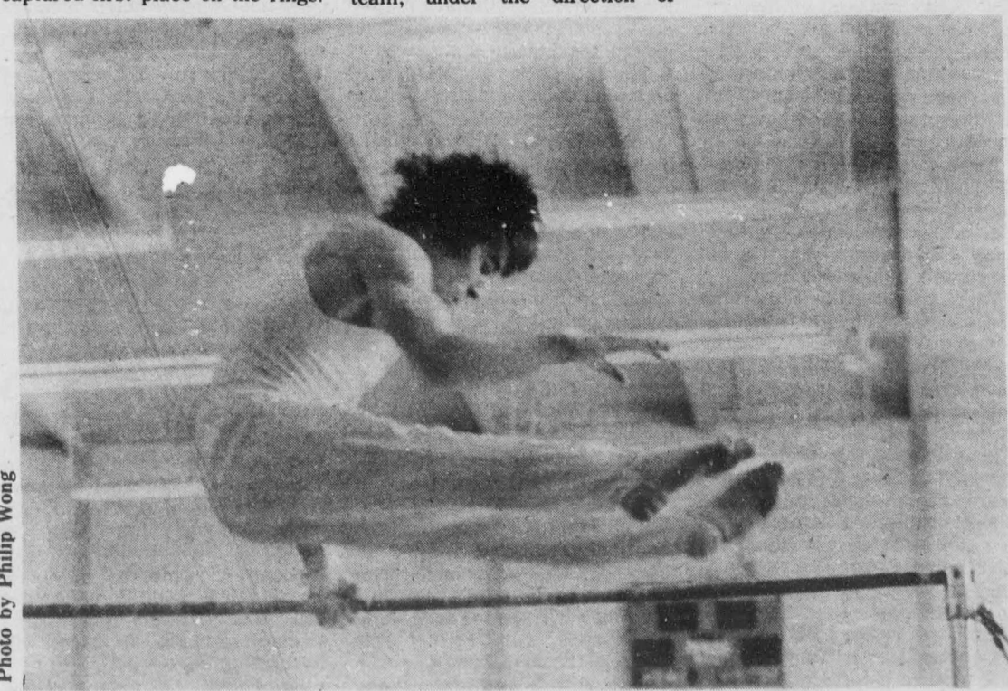
UNB's men gymnastics team, the Saltos, qualified to go to the CIAU championships this weekend by winning the AUAA meet held here last weekend

A number of events, including underwater obstacle, chariot, three-legged and tricycle races as well as a banana-eating contest will be part of the action to be