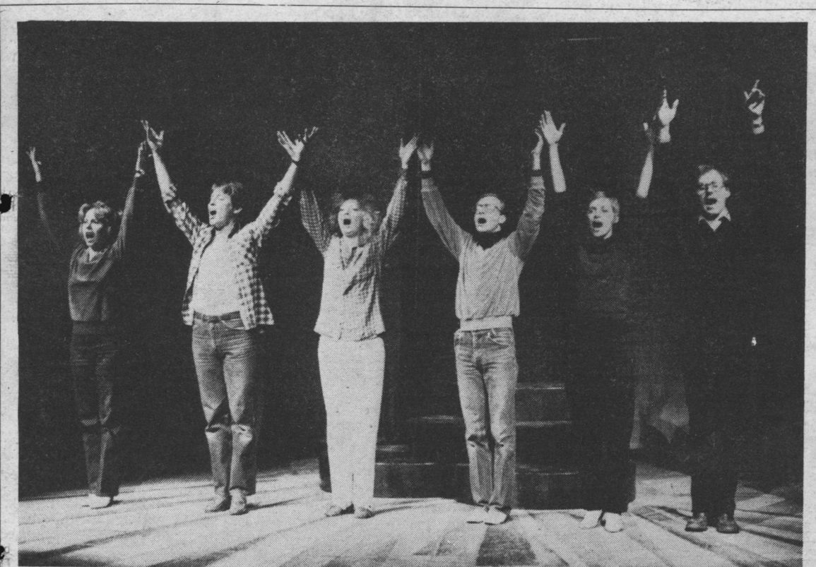
An ancient ritual to melt the snows? No, but it's close. The cast of the reborn comedy revue Spring Thaw warmed up the audience last night in SUB Theatre.