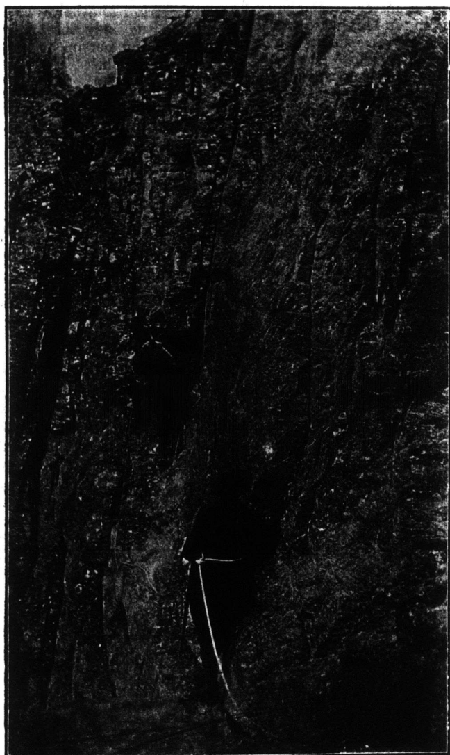
Climbing on Pinnacle Mount.

Lawrence, Alta. Sir.—Allow me to pen a few lines to your valuable magazine, which I think is improving every issue. In reading the February issue, I read a letter