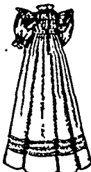
Infants' Dress. One size: Price, 10d. or 20 cents.