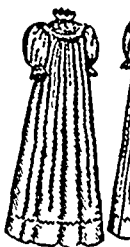
Infants' Dress, with Round Yoke and with Straight Skirt for Hemstitching. One size: Price, 10d. or 20 cents.