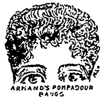
Beautiful style of Bangs, $5 and $7.