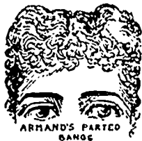
Handsome Parted Bangs, $2.50, $5 and $7.50.

Quickest, easiest, cheapest and best single preparation in the market. Price, $1.25. Superfluous hair safely removed and destroyed with CAPILLERINE. $2.00 by post.