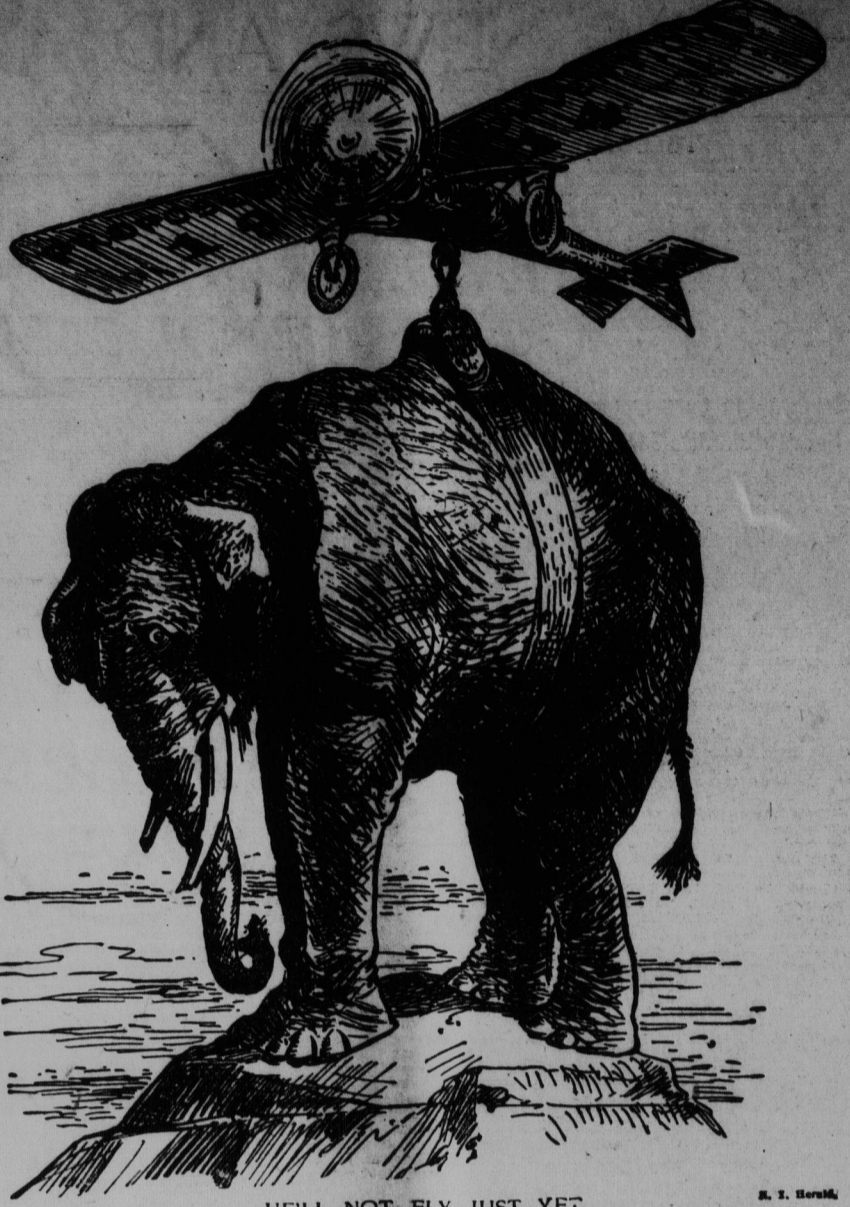
HE'LL NOT FLY JUST YET.

Thieves Busy? Although no verification of the report was received from the management, it was learned yesterday that on one day last week a lady in one of the large stores while making a purchase was jostled in the crowd during the busy hours of the afternoon and relieved of a sum of money in the vicinity of a hundred dollars.