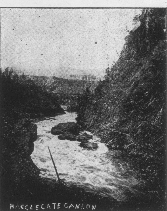
HAGGLEGATE CANY ON-SKEENA RIVER.

mot be located until the diamond drid Indians came to the Kishpiax missionary is introduced. On the bench lands excellent feed for other property having been fenced in by