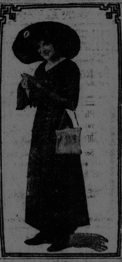
hat in the light of day. Colors seen by candle light do not look the same by day. Never, never forget this. Don't buy a hat when you are in a hurry.

Don't buy a hat merely because it is expensive. Because a hat costs fifty dollars does not mean it will become your own. Always, before buying, examine your hat in the light of day. Colors seen by candle light do not look the same by day. Never, never forget this. Don't buy a hat when you are in a hurry.