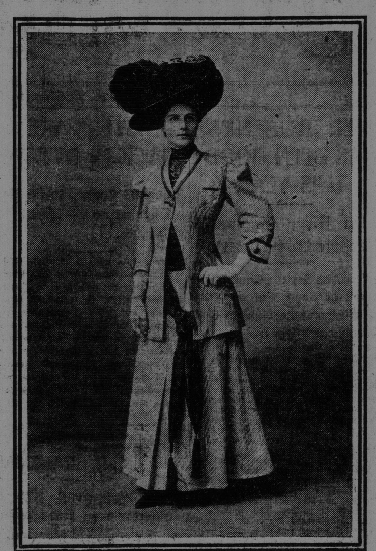
WALKING COSTUME WITH SATIN SASH.