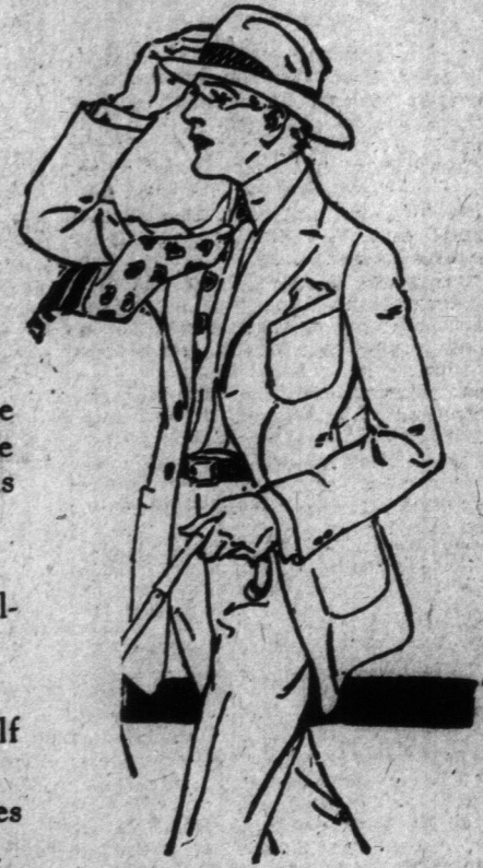
—Main Floor, Queen St.

And Oliver Khaki Slickers, single-breasted, buttoning to chin, with standing collar lined with drab corduroy, closing with clasp fasteners. Sizes 36 to 44. Today, special, $4.75.