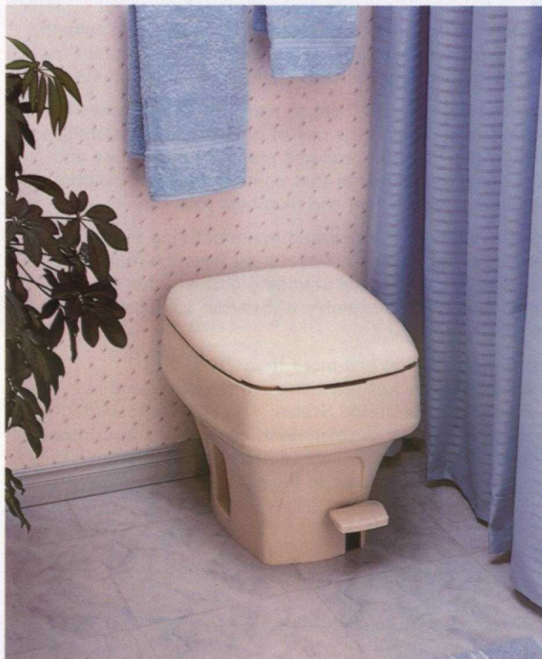
The Flush-O-Matic water miser uses 95 per cent less water per flush than a conventional toilet.

Department of Canada 150, rue St. Joseph Québec, Québec Canada H8S 2L3 Tel: (514) 834-8881 Fax: (514) 834-1098