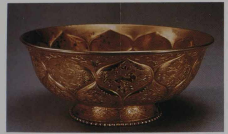
Gold bowl with mandarin ducks and lotus petal design. Tang dynasty, height 5.5 cm, diametre 13.7 cm. Collection of Shaanxi Provincial Museum.

Chang'an, known today as Xi'an is a famous historical city in China. In the Han and Tang dynasties, Chang'an was not only the capital but the starting point of the Silk Road. "Treasures of Chang'an" is a special exhibition at the Hong Kong Museum of Art, giving a comprehensive view of that era's artistic achievements. Exhibits include: pottery figures, bronzes, silk fabrics, stone sculptures and architectural items, many of which are very rare.