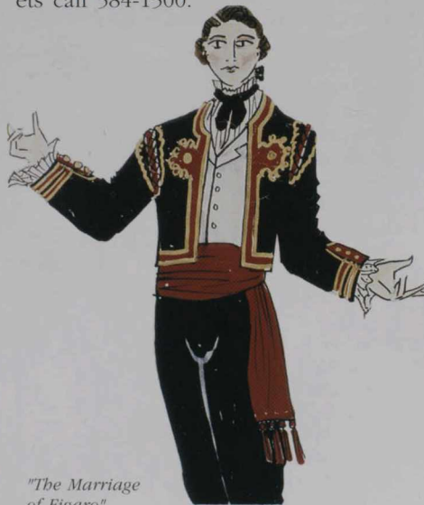
"The Marriage of Figaro"

The classic opera, "The Marriage of Figaro", combines a dramatic intensity and comedy with the brilliant music of Wolfgang Amadeus Mozart. Originally considered scandalous by the Emperor of Vienna, the first performance of Figaro opened to stunning success in Vienna in 1786. This version, put on by the Hong Kong Academy for the Performing Arts, is sung in Italian with Chinese and English subtitles. For tickets call 584-1500.