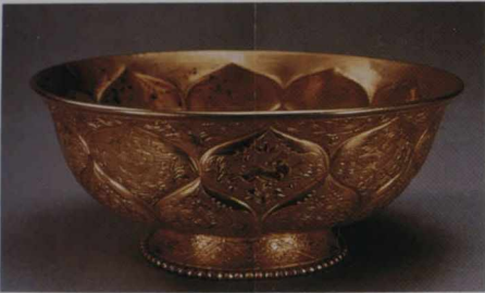
Gold bowl with mandarin ducks and lotus petal design. Tang dynasty, height 5.5 cm, diameter 13.7 cm. Collection of Shaanxi Provincial Museum.

Chang'an, known today as Xi'an is a famous historical city in China. In the Han and Tang dynasties, Chang'an was not only the capital but the starting point of the Silk Road. "Treasures of Chang'an" is a special exhibition at the Hong Kong Museum of Art, giving a comprehensive view of that era's artistic achievements. Exhibits include: pottery figures, bronzes, silk fabrics, stone sculptures and architectural items, many of which are very rare.