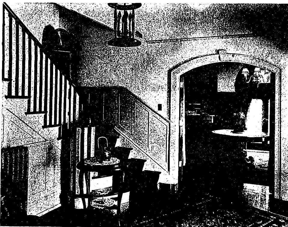
HALLWAY IN PAGE RESIDENCE.

The fireplace in living room is of terra cotta. The fireplace in den is of rough brick, and mantel in owner's room is a light pressed brick.